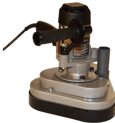
U-SAND MINI® Hand held random orbit sander

IMPORTANT Please make certain that the person who is to use this equipment carefully reads and understands these instructions before starting operations.